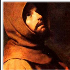
Saint Francis of Assisi 1182-1226 Feast: 4 October

St Francis was a soldier born into a noble family, but he gave up everything and devoted his life to Christ after hearing God's call in a homily. St Francis went on to establish the Franciscan Order and famously loved nature—he was said to tame wild animals and preach to the birds. St Francis set up the first known Christmas Nativity scene in 1220