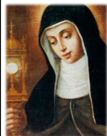
Saint Clare of Assisi 1194-1253 Feast: 11 August

St Francis was a soldier born into a noble family, but he gave up everything and devoted his life to Christ after hearing God's call in a homily. St Francis went on to establish the Franciscan Order and famously loved nature—he was said to tame wild animals and preach to the birds. St Francis set up the first known Christmas Nativity scene in 1220